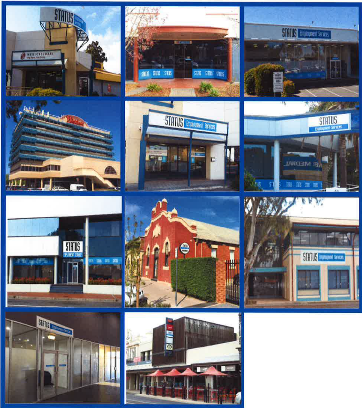
Top Row: L-R, Modbury Dress for Success , Elizabeth jobactive/DES/SEE, Kilkenny jobactive/DES Second Row: L-R Marion Corporate Services/DES/SEE, Modbury jobactive/DES, Modbury SEE/Management Hub Third Row: L-R Noarlunga DES/SEE, Port Adelaide Training Services/jobactive/DES, Salisbury jobactive/DES Fourth Row: L-R Salisbury SEE, Gawler jobactive/WfD